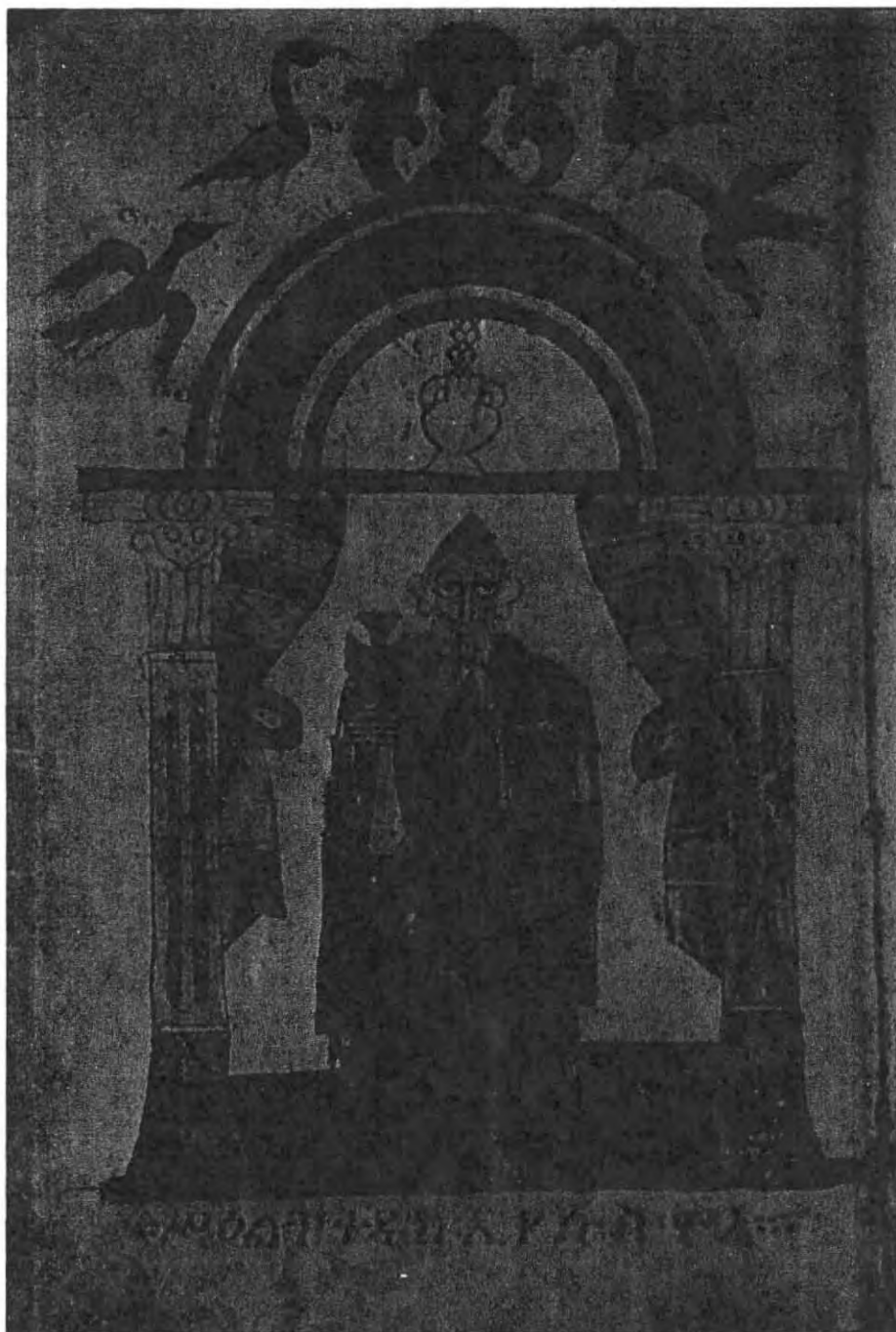
Plate 1. Abuna Iyyasus Mo'a, founder of Dabra Ḥayq Eṣṭifānos (EMML Pr. No. 1832, f. 5b)